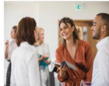
Free Career & Resume Advice