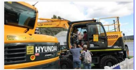
See Who is at the Show