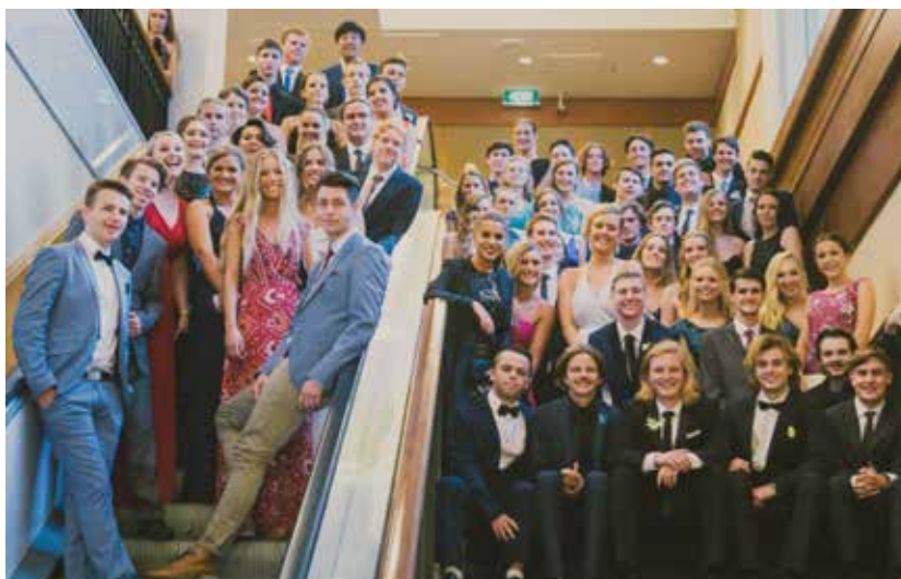
2015 Leavers - do you recognise yourself???