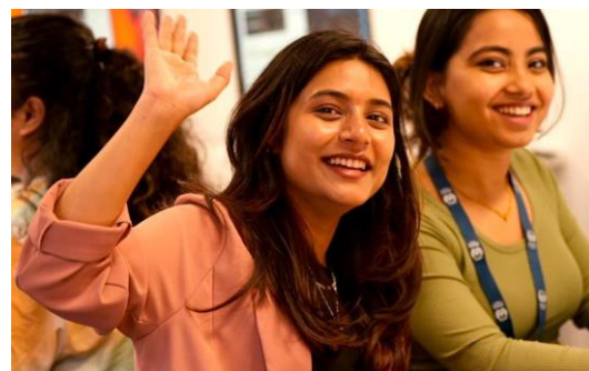
GRAB A GOODY BAG