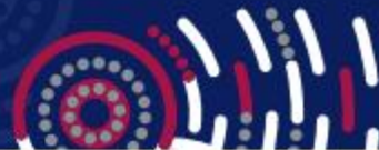
Image: The Currency of Country, ink on paper, 2017 ©Shawana Andrews. The people come together to trade and share. They are dressed in possum skin cloaks and have a basket of ochre, berries, yams and eggs to exchange. There is also an axe of stone and timber to be traded. The squares represent the shared knowledge built over generations of cultural memory. The people are connected with a songline and they look to the ancestors to learn and maintain culture.

"The camp was really fun and added variety in my school holidays. It also helped focus back in to school because of all the presentations that we were given from a variety of different people involved in and around business."