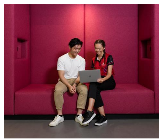
PERSONAL CONSULTS 9am - 5pm, Mon - Fri

Book a 30-minute phone or Zoom consultation with one of our expert student advisors. Book a consult to help troubleshoot any questions you have about your study options for next year.