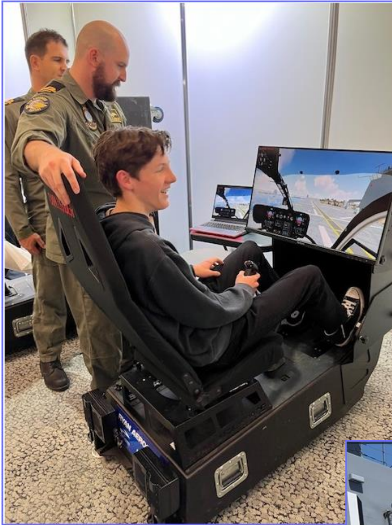
.... Helicopter simulation