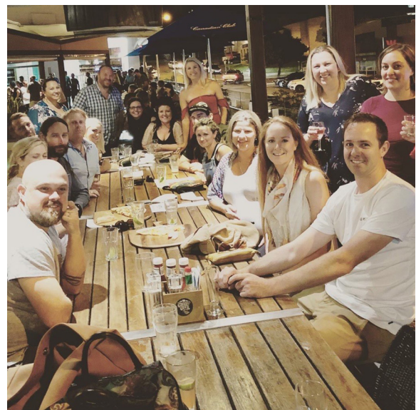
Above: Class of 1999 reunion

If you and your old school friends would like to hold a reunion at the College, please get in touch via email - see below for email address. We would love to hear from you also if you hold a reunion outside the College. Please send us some photos!!