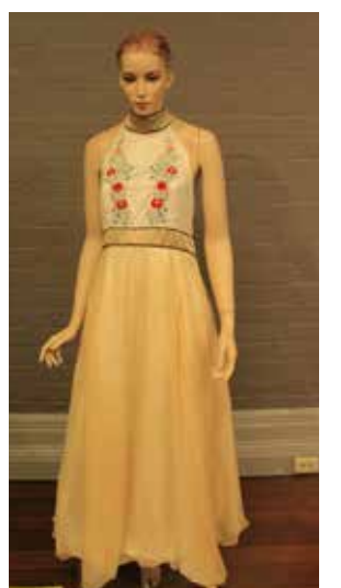
Melody's dress on a mannequin